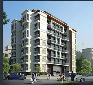
OUR RECENT ACHEIVEMENTS...