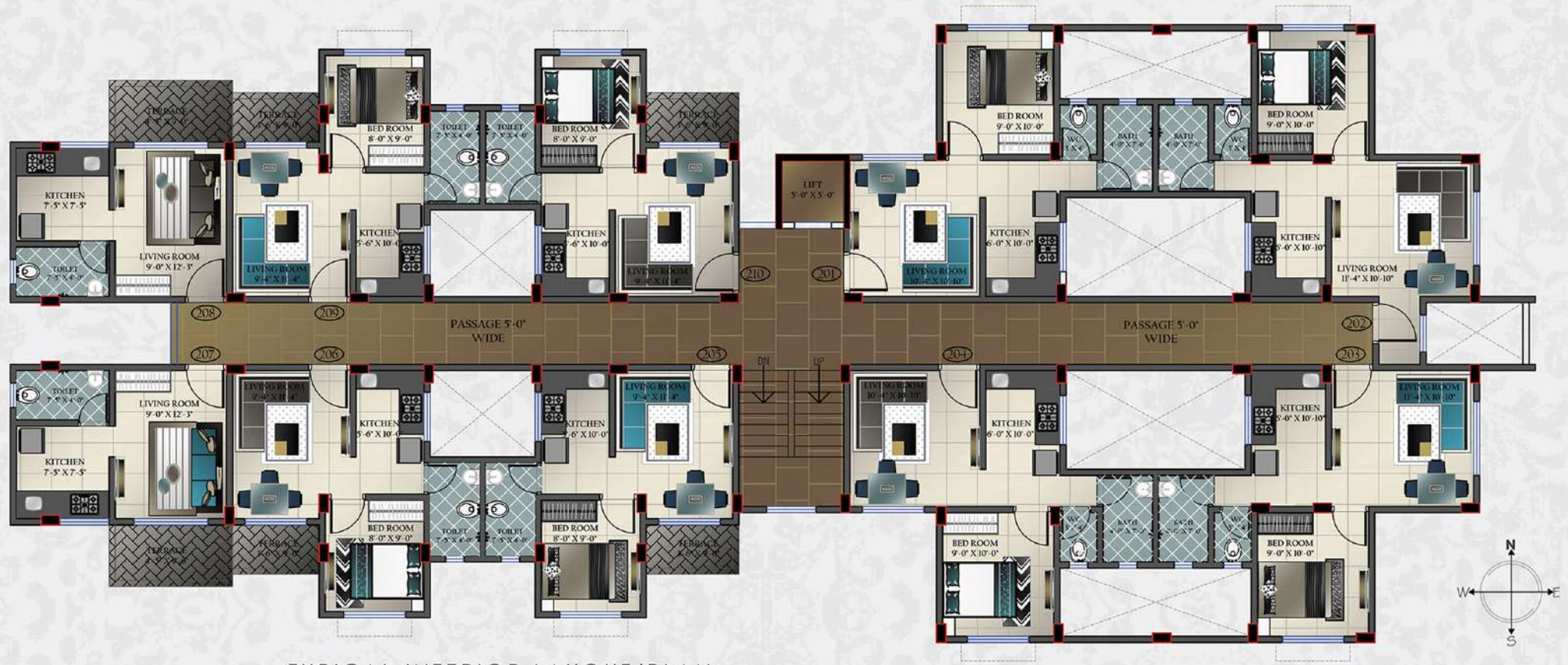
TYPICAL INTERIOR LAYOUT/PLAN